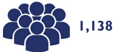
Number of people affiliated with NGOs receiving anti-corruption training.

USAID continued its partnership with civil society in 2017, leading the push for additional reforms to secure a European future for Ukrainians. With USAID support, the Reanimation Package of Reforms (RPR) -- a leading civil society coalition of hundreds of experts, think tanks, academics, and human rights defenders -- successfully advocated for the enactment of dozens of reform laws and helped block a number of undemocratic draft laws. Partners like the Anti-Corruption Action Center and Transparency International Ukraine relentlessly pushed for the passage of anti-corruption legislation and ushered in the creation of national-level corruption prevention and investigation bodies. USAID worked to maintain the civil society legal enabling environment, as well as provided technical support to help pass laws on volunteerism and public associations and insert non-profit status amendments to the tax code. In 2017, more than 200 CSOs increased their capacity significantly thanks to USAID's technical assistance and funding, leading Ukraine to attain the highest score on the Civil Society Sustainability Index in the Eastern Europe region. As a result of USAID's assistance, today it is easier for citizens to organize and for organizations to take action to advocate for the public interest.