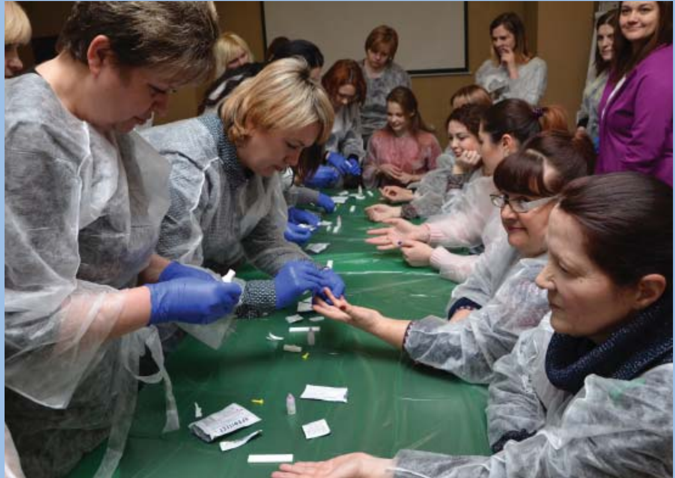
Doctors and nurses training in Odesa to use HIV rapid tests.

In 2017, USAID provided critical support for health reforms that introduce a transparent and efficient health system and better respond to the needs of the Ukrainian people. USAID continued to help Ukraine respond to its high burden of infectious diseases, including HIV/AIDS, viral hepatitis C, and multi-drug resistant tuberculosis (MDR-TB). USAID also worked to counter widespread misinformation about immunization, which has led health providers and parents to downplay its importance and led to a drop in vaccination rates in recent years.