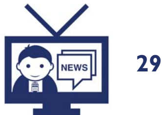
Number of media sector institutions that assisted independent media or journalists.

Independent news sources are key to mediating the relationship between citizens and the state and increasing government accountability. In 2017, USAID helped strengthen freedom of the press and access to objective information for Ukrainian citizens by supporting media-related civil society organizations and dozens of print, radio, TV, and Internet outlets through training, consultation services, technical assistance, and grants to media outlets. Notable achievements include the establishment of an independent National Public Broadcaster. Media CSOs also advocated for the enactment of key media legislation, such as amendments to the Language of Audiovisual Media, which introduced Ukrainian language quotas for TV broadcasters. In 2017, USAID supported the introduction of a course for Ukraine's elementary school curriculum that increases media literacy among Ukrainian youth.