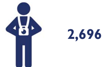
Number of training days provided to journalists.