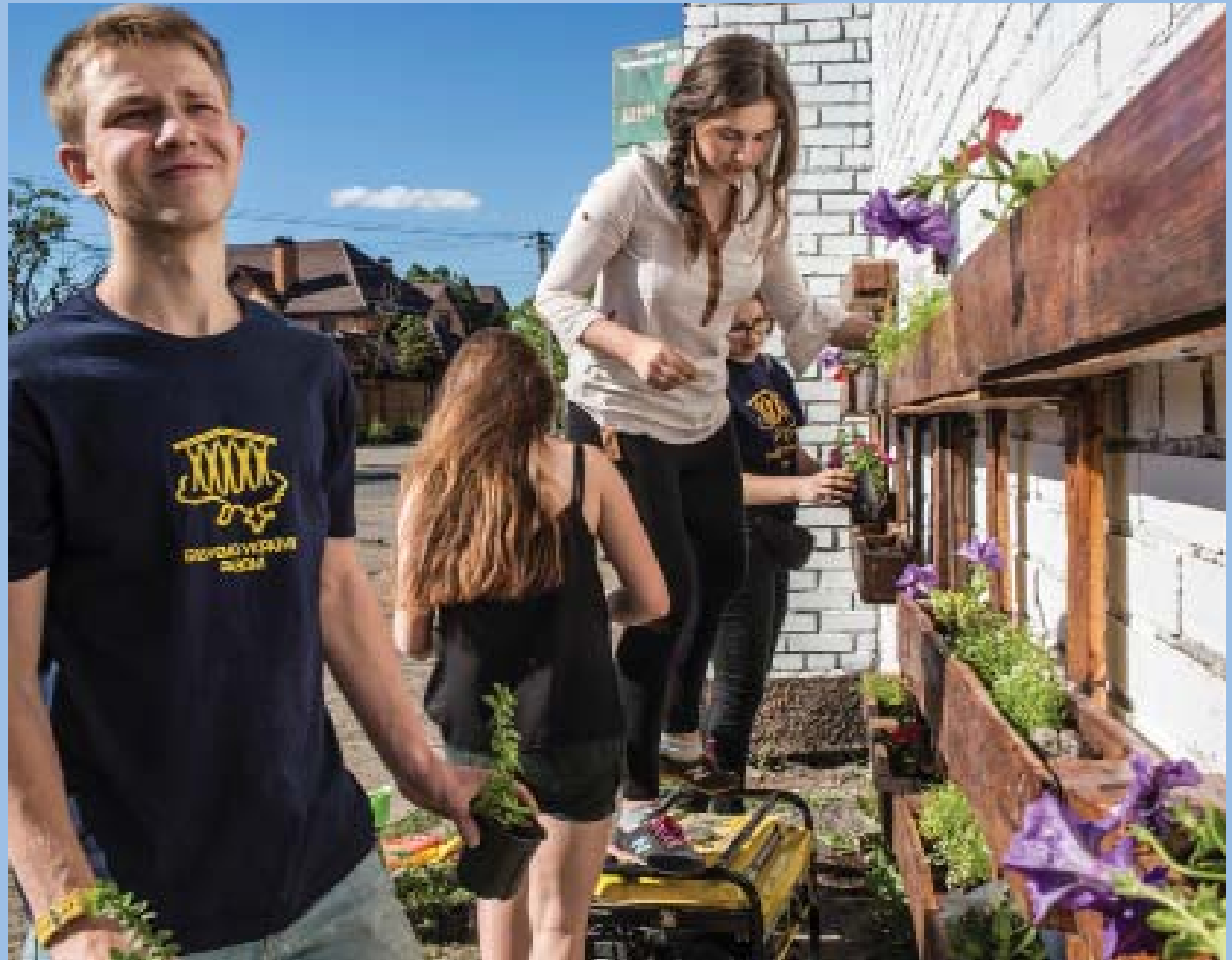
Volunteers beautify public spaces in Eastern Ukraine as part of the Build Ukraine Together camp.

U SAID provided conflict-affected populations with life-saving assistance in 2017, including food, health care, nutrition, shelter, and other humanitarian needs to vulnerable households in both government-controlled and non-government-controlled areas, while also laying a foundation for longer-term recovery. USAID's programs also helped connect areas close to the conflict to the rest of Ukraine, demonstrated the tangible benefits of reform, and provided information that counters malign and divisive narratives in Eastern Ukraine.