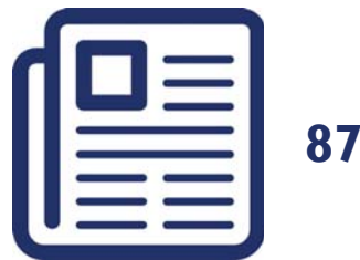
Number of non-government owned news outlets.