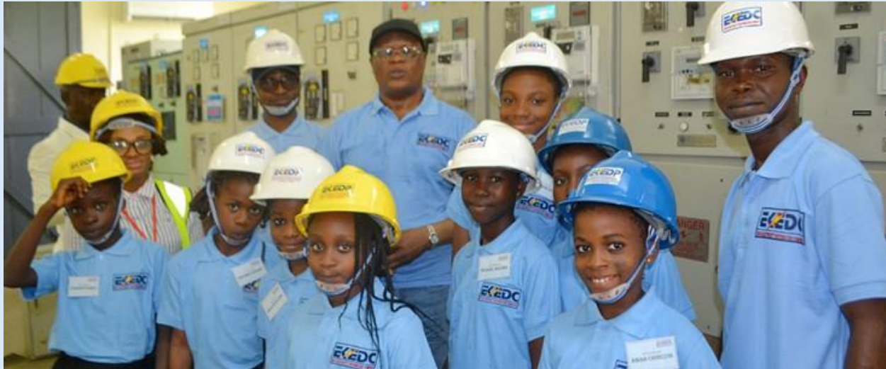
Girls attend EKEDP's first ever Bring Your Daughter to Work Day, supported by USAID's Engendering Utilities Program.

gender bias in hiring practices, working with local schools to increase interest in the energy sector among girls, and instituting “Take Your Daughter to Work Days” (Cain et al., 2016).