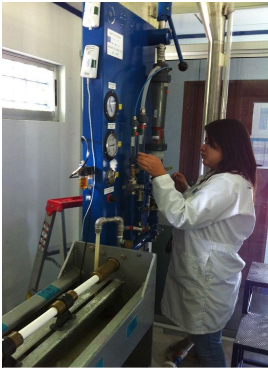
Employee at ARESEP conducting inspection