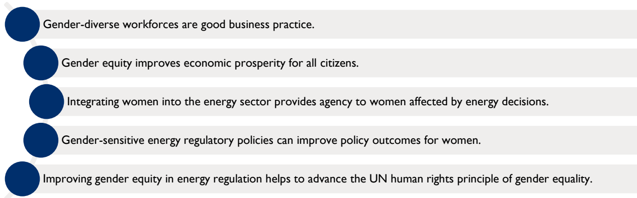
Figure 1: Why Gender Equity Matters in Energy Regulation

Findings from research, expert interviews, and case studies point to the need for the energy regulatory sector to take assertive steps toward inclusivity for women. Women participate in the energy sector as energy users, employees, participants in the energy value chain, and as decision-makers and stakeholders. These roles intersect with many areas over which energy regulators have jurisdiction, including tariff-setting, licensing, interconnection, ensuring reliability, procurement, rural electrification, stakeholder engagement, and internal human resource policies. Regulators can use these areas of jurisdiction to empower and support women as employees and policy-makers, consider gender-differentiated impacts of regulatory policy and energy decisions on energy users, and identify ways to minimize negative impacts from infrastructure projects and help direct those projects to improve the livelihoods of vulnerable populations.