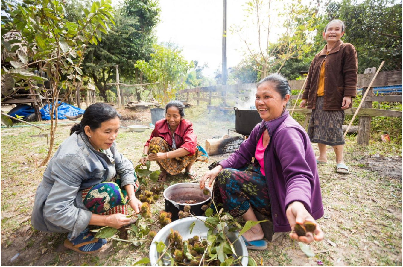
Community members on the Nakai Plateau