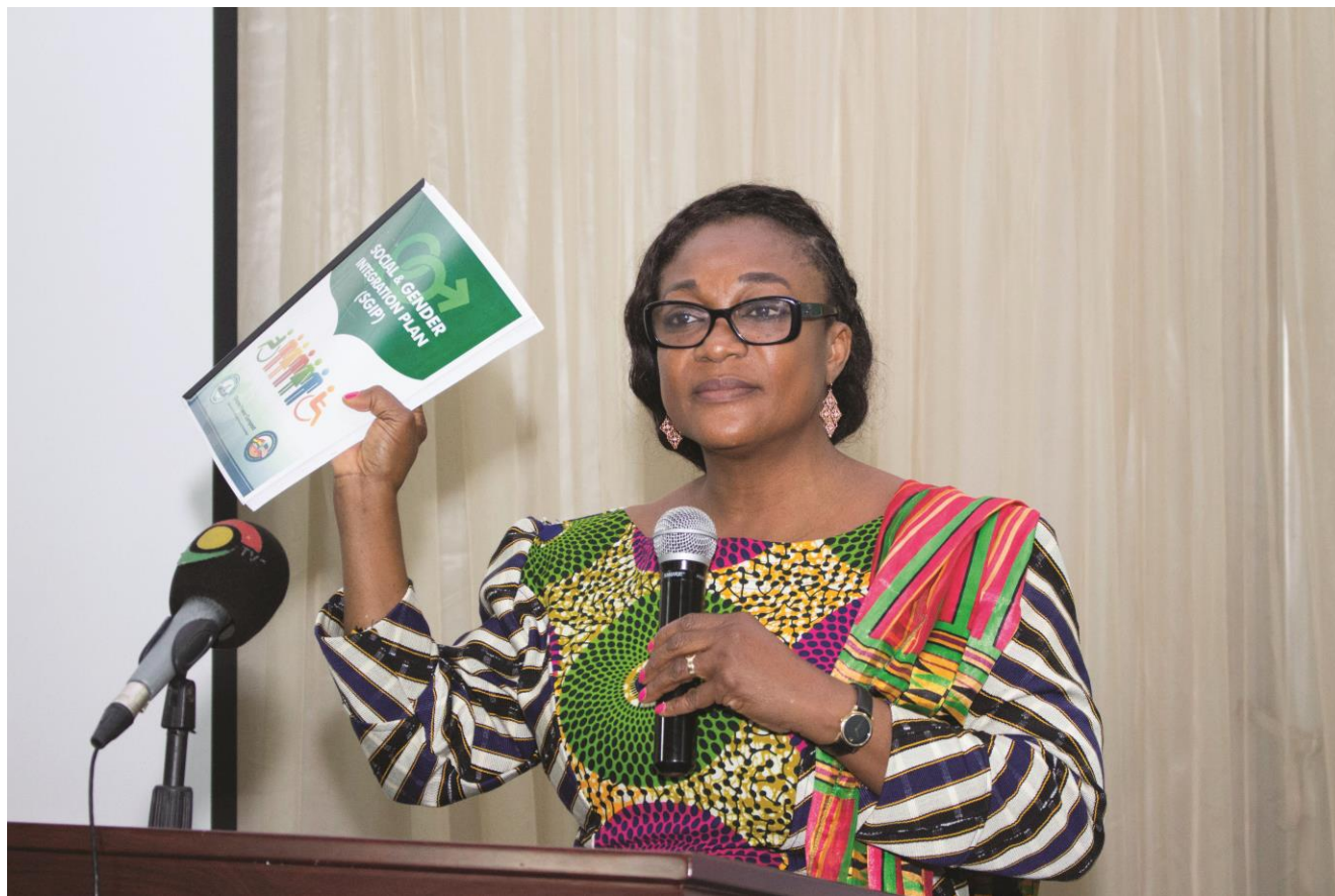
The Honorable Otiko Afisah Djaba, Minister of Gender, Children, and Social Protection at the launch of the Social and Gender Integration Plan.

Despite this progress, challenges remain. For instance, the proportion of employed men is 2.5 times greater than women (Ghana Power Compact, 2017). Ghana's electricity connection charge has tripled since 2011, which has increased the cost of electrification efforts, and female-headed households continue to earn less income and spend a higher percentage of their income on electricity (Millennium Development Authority [MiDA], 2017). Sustained poverty reduction will require a commitment to reducing inequality and improving access to