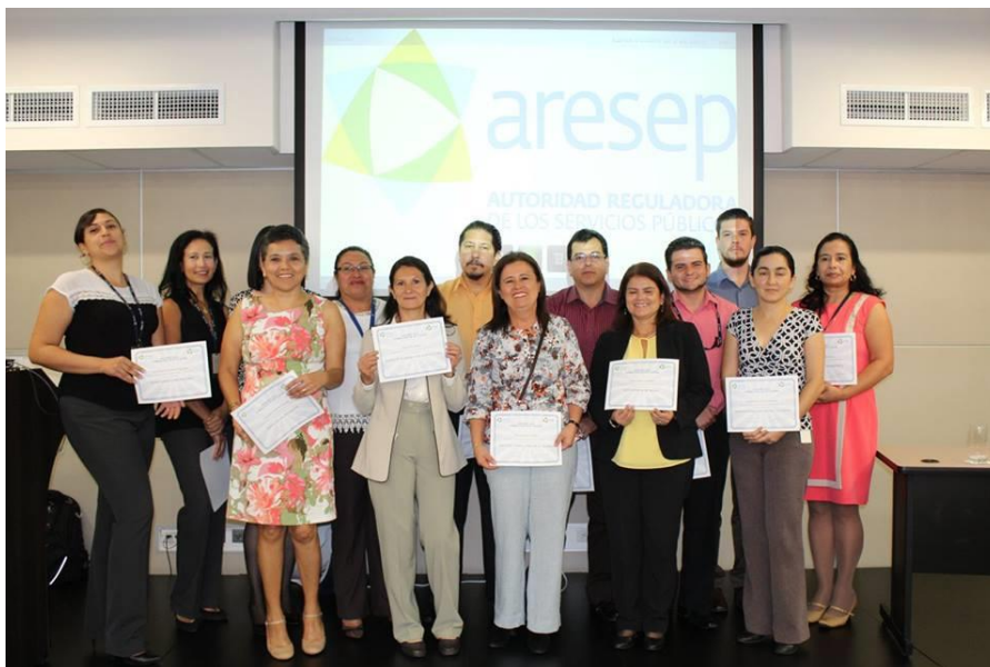
Employees of ARESEP on the National Day of Equity, (ARESEP, 2018).