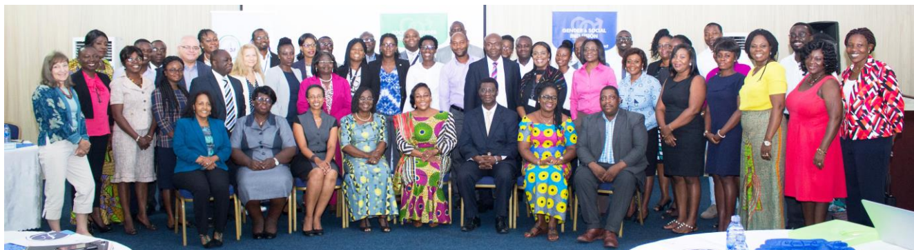
Participants at the launch of the Social and Gender Integration Plan.

authorities in the energy sector; the Energy Commission and the Public Utilities Regulatory Commission (PURC). The Energy Commission is responsible for technical regulation of the power sector, including licensing of public and private operators, collecting and analyzing power sector data, and advising the Ministry of Energy on energy policy and planning. The PURC is responsible for economic regulation of the power sector, including approving electricity tariff rates for the electricity sold by distribution utilities and monitoring the quality of electricity services delivered to consumers. In approving tariffs and setting service quality standards, PURC must consider the financial stability of the utility companies and the impact on the poor and vulnerable, including women (Kumi, 2017). PURC is also responsible for monitoring the effectiveness of the lifeline tariff in benefiting vulnerable groups.