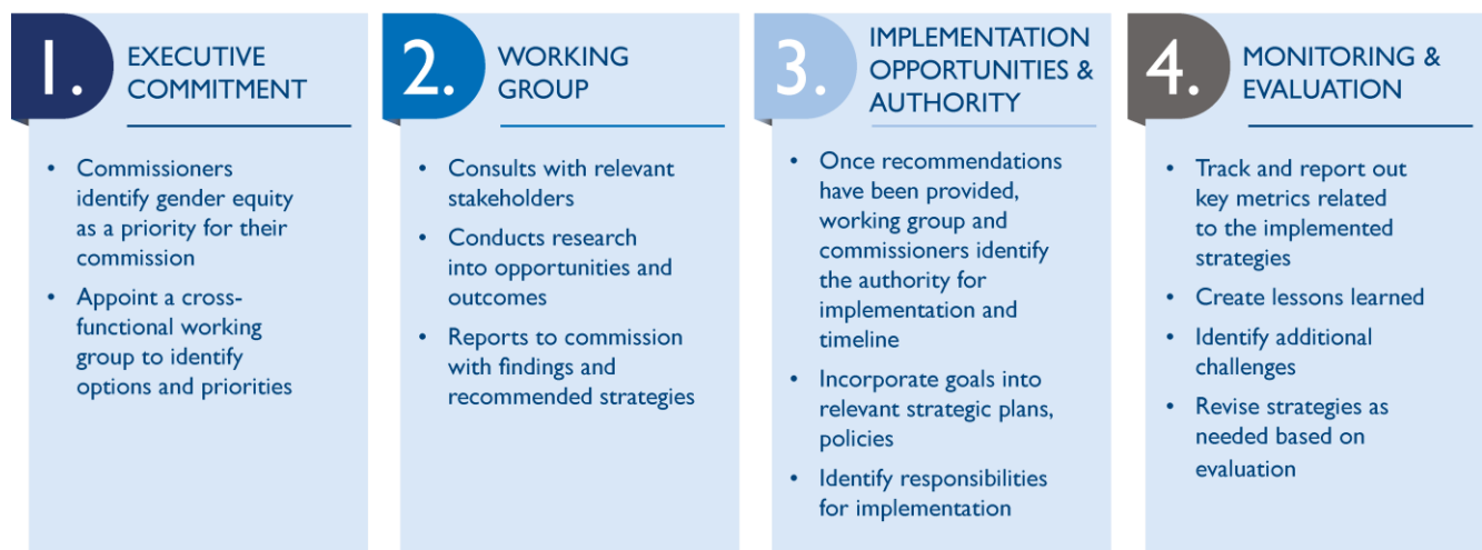
Figure 4: Planning Process Steps for Gender Equity