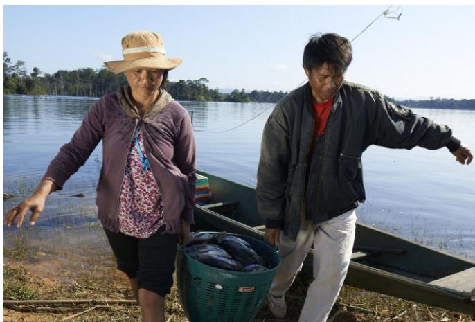
Community members in Nakai (NTPC, n.d.).

Intersection of Gender and Ethnicity: The rich ethnic diversity of Lao PDR has led to some resettlement challenges, especially in cases when villages with different cultural practices are resettled together. Analysis of ethnic intersectionality is still rare within social impact assessments of hydro projects. Some developers have begun to use local trainers in capacity-building programs for women, who speak multiple languages and can better ensure that the needs of ethnic groups are accounted for (Kittikhoun, 2018) (Thippawong, 2018).