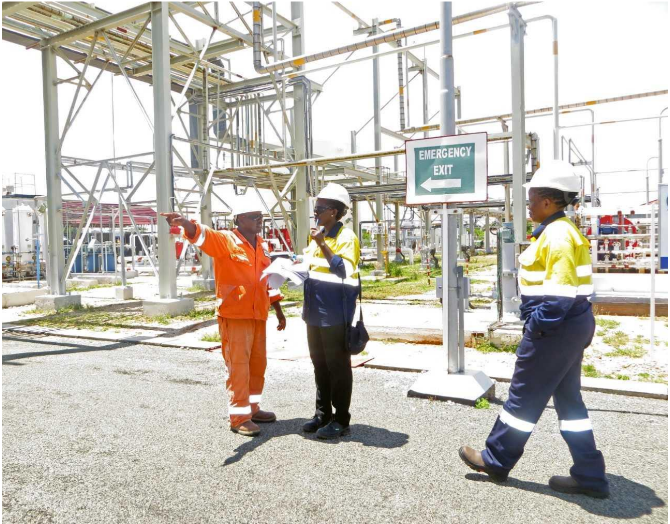
Intern in Tanzania gains skills in monitoring. EWURA is a host organization for NARUC's Women in Energy Regulation Pilot Internship Program (NARUC).

Despite these steps, experts still note that the Government has experienced challenges in putting its gender mainstreaming policies into practice, in part due to the patriarchal culture that dominates the country (Secretariat of the African Community of Practice on Management for Development Results, 2017). Patriarchal culture often limits the role that women have in decision making due to “high levels of intra-household inequality” (IISD, 2016) and contributes to the differing ways men and women use electricity. Nevertheless, the Government continues to support mainstreaming gender in the energy sector.