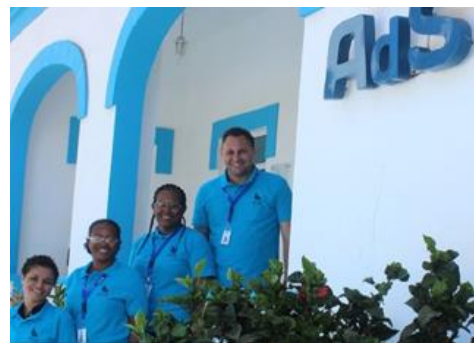
Staff of the office within AdS, a newly formed local utility institution, dedicated to responding to women's needs. (Cassirer & Stoll, 2017)

Working alongside the Government, the MCC helped create new water utility institutions at the national and local level. To do this, the Government launched the National Agency for Water and Sanitation. Recognizing the importance of including impacts on women and other vulnerable populations, it also created an Office of Environment and Gender and Social Integration within this new agency. This Office collaborates with other departments to include social and gender data in planning, policy discussions, and monitoring throughout the sector (Cassirer & Stoll, 2017). In parallel, local water utilities also consolidated their independently operated municipal and utility water services into one utility, Aguas de Santiago (AdS), for the island of Santiago (in which half of the country's population lives). The utility has created an Office of Information, Education and Communication, and Social, Gender, and Integrated Management to inform the other units within the utility. Furthermore, each construction contract to improve water infrastructure, carried out under this Compact, mandated that contractors have a 30-percent quota for women's employment, and each project has a specialist dedicated to ensuring this target is met (Cassirer & Hopkins, 2018).