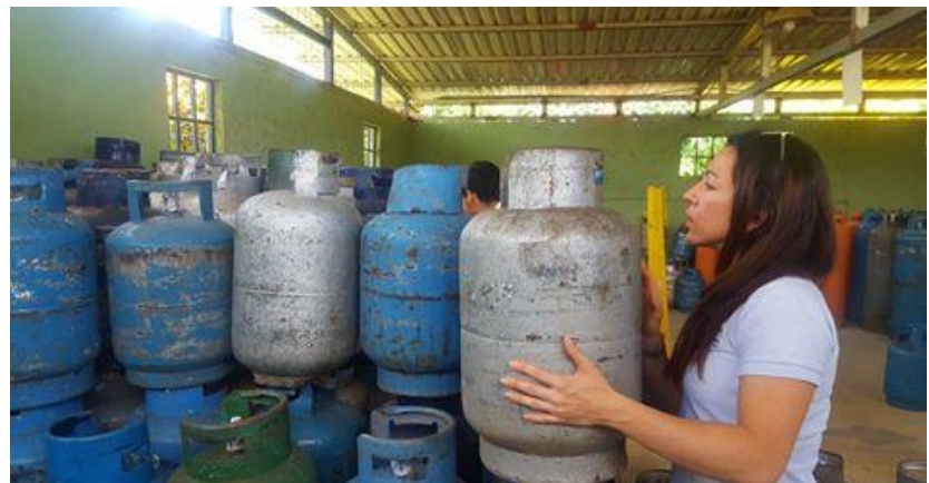
ARESEP employee inspecting gas tanks (ARESEP, 2018).

Similar to Costa Rica, many countries have set national policies and goals related to the employment and participation of women in the labor force. These types of policies can help drive regulatory commissions and private/public sector entities to implement internal and external organizational policies to support these goals. Overall internally, Costa Rica's energy sector entities are in earlier stages of building awareness of gender inequities in the energy labor force and find ways to address this, both through organizational policies and supporting women in other