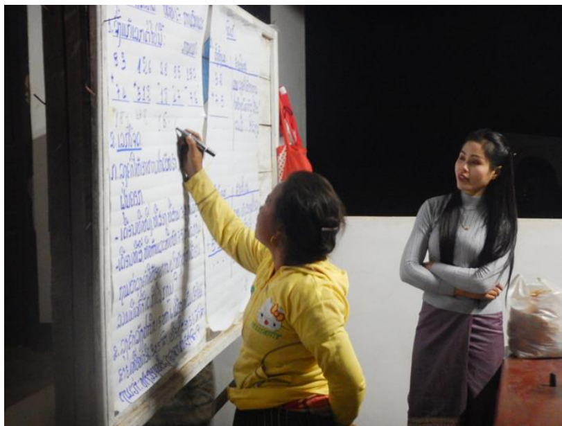
Literacy classes for community members in Nakai (NTPC, n.d.)

Inclusion of Resettled Women: In addition to increasing the capacity of local committees, developers have also focused on communicating and building the capacity of women in resettlement villages. The Lao Government is collaborating with the Natural Heritage Institute on a Sustainable Hydropower Plan for the Xe Kong River Basin. The initiative has held several workshops and has a new focus on increasing the participation of women from all backgrounds in consultations (Natural Heritage Institute, 2017). Organizations, such as Oxfam, have trained organizations active in hydropower development and oversight on gender-sensitive communication and incorporating considerations of minority groups (Thiphawong, 2018).