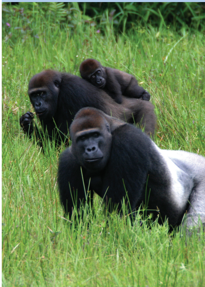
REPUBLIC OF CONGO – 2004: Endangered western lowland gorillas in Mbeli Bai, Nouabalé-Ndoki National Park enjoy better protection due to USAID's conservation efforts.