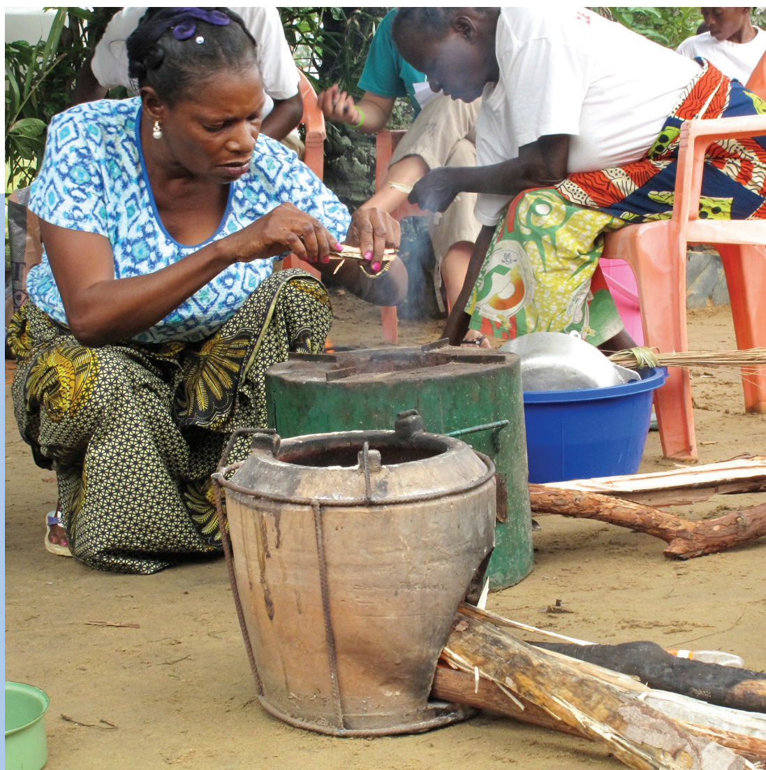
REPUBLIC OF CONGO – 2014: Testing fuel-saving cook stoves as a strategy to reduce forest degradation and deforestation in the Batéké-Leconi-Léfini landscape.

Now in its third phase, CARPE is "institutionalizing" the management of the Congo Basin forests through individual, organizational and systems capacity building. To achieve this, two distinct but interdependent projects have been established: the Environmental Monitoring and Policy Support (EMAPS) project, which works to boost the quality and scope of conservation policy-making, and forest monitoring, analysis and information dissemination; and the Central Africa Forest Ecosystems Conservation (CAFEC) project.