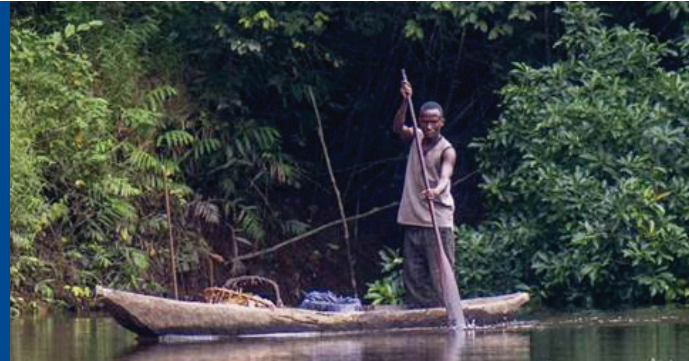
DEMOCRATIC REPUBLIC OF THE CONGO – 2014: Man fishing on the Salonga River. USAID is supporting sustainable fishing practices in the landscape.