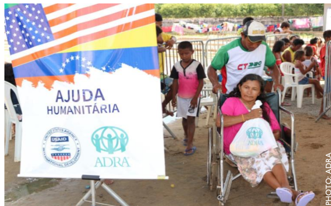
Photo: Vulnerable Venezuelans receive food assistance from a FFP-funded ADRA program.