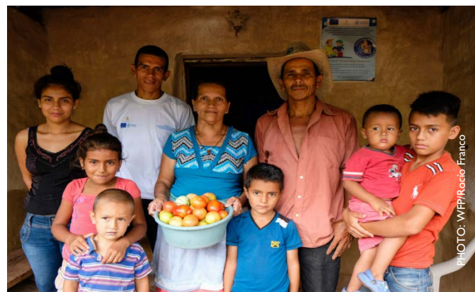
Photo: FFP partner WFP works with families in the Dry Corridor to improve food security.