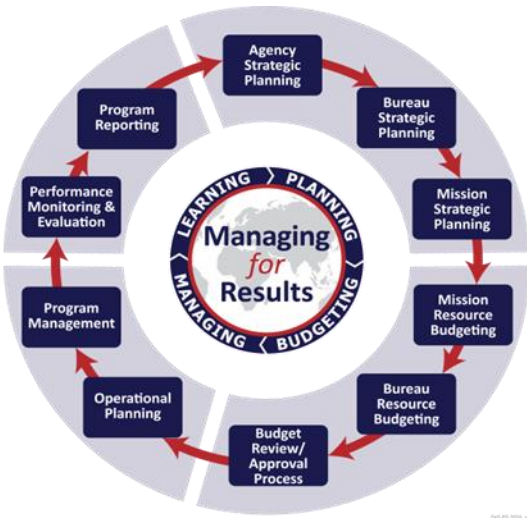
State Department Performance Framework