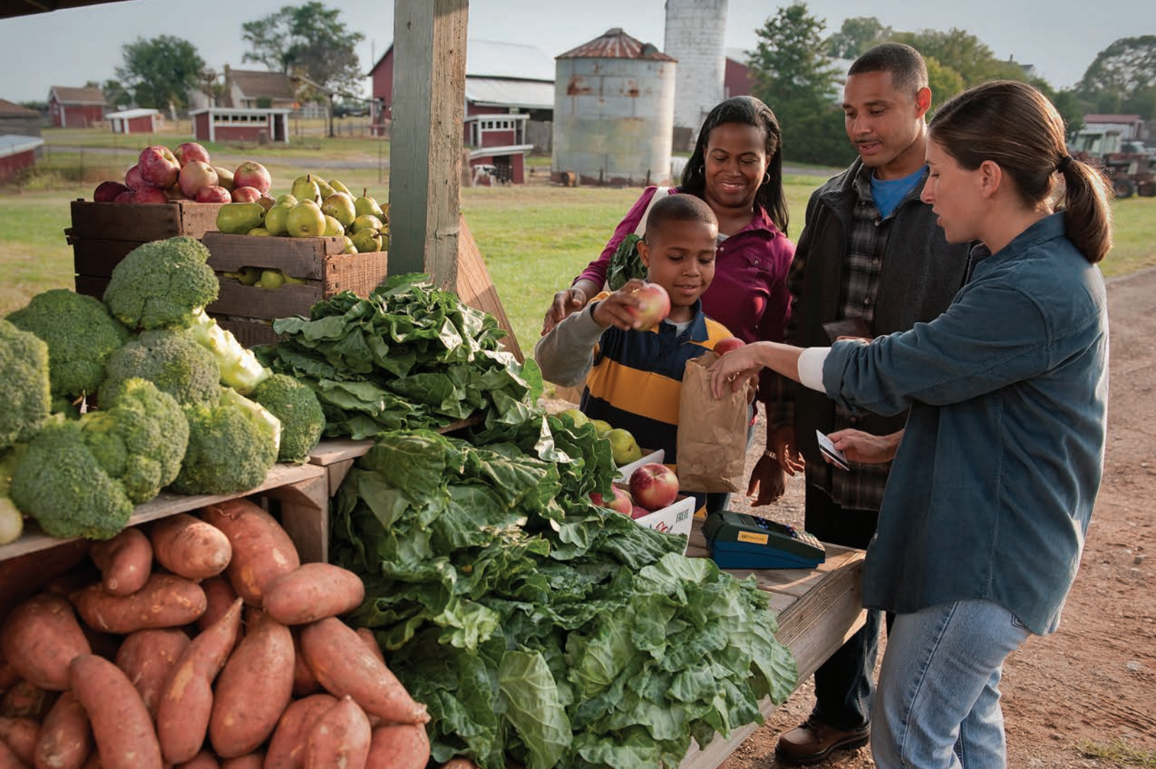
USDA's Food and Nutrition Service