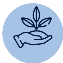
Small agricultural producers

Because 80 percent of sub-Saharan African farms are smallholdings 1 employing 60 percent of sub-Saharan Africans, most of whom live in rural regions 2 , partnering with agricultural inputs suppliers and industry associations is one of the best ways to reach new customers. Agricultural associations are often well-organized and collaborative groups that have a network of stakeholders who produce, process, stock, and distribute agricultural commodities. MFIs often have relationships with these groups. These farmer-based associations aim to support the well-being of members who are: