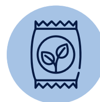
Seed suppliers and nurseries

To increase access to energy, in particular for lower-income customers without significant savings, OGS suppliers should consider offering consumer finance options to their customers. Although some OGS companies provide consumer finance in the form of pay-as-you-go (PAYGO) credit, this is not always possible in all areas of a country, and so other types of consumer finance need to be explored. OGS companies can partner with MFIs to provide a wider range of credit options for purchasing solar systems, particularly to last-mile customers in rural areas.