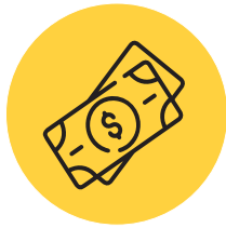
Size of installments

When starting out, MFIs need to review their financing criteria to ensure that they meet customers' needs in terms of: