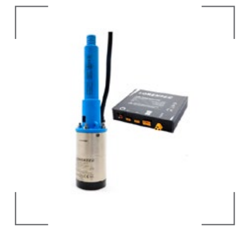
TERMS OF SALE Cash & carry