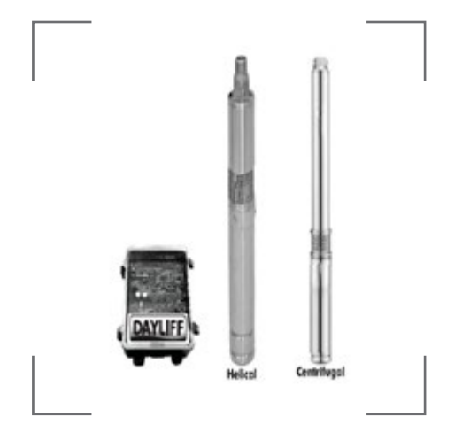
TERMS OF SALE Cash & carry