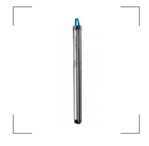
TERMS OF SALE Cash & carry