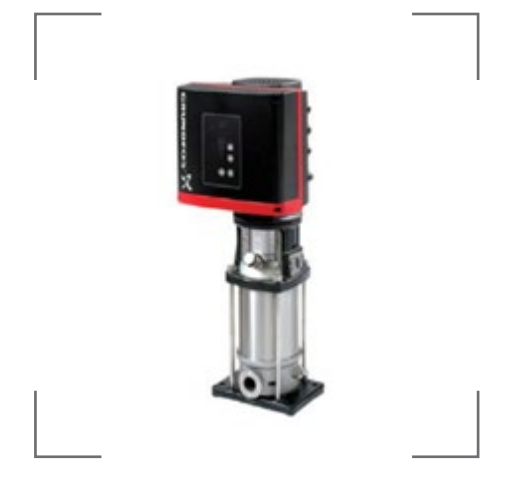
TERMS OF SALE Cash & carry