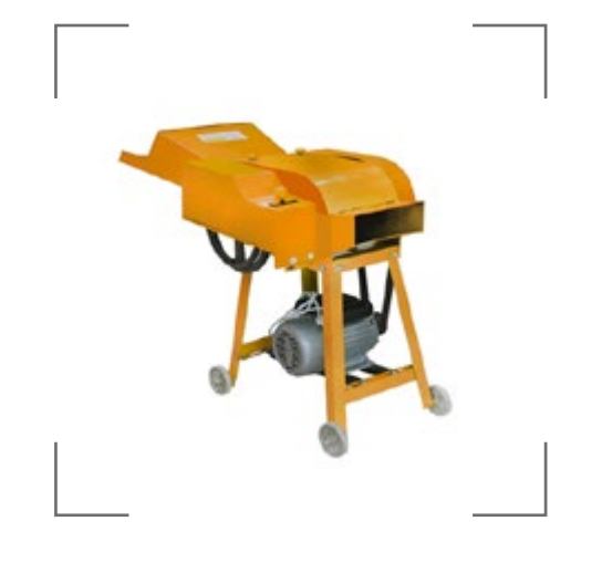
TERMS OF SALE Cash & carry