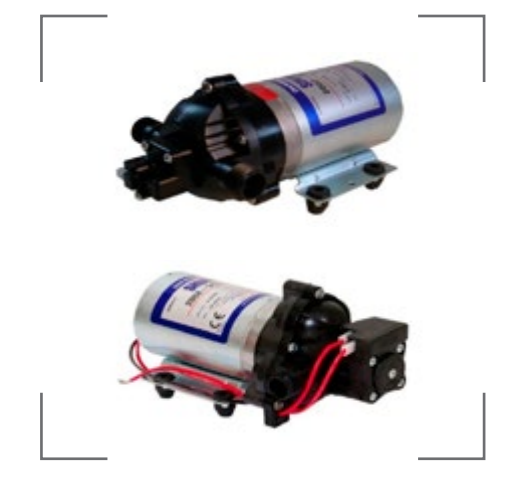
TERMS OF SALE Cash & carry