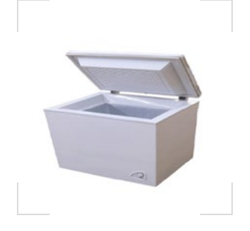
TERMS OF SALE Cash & carry