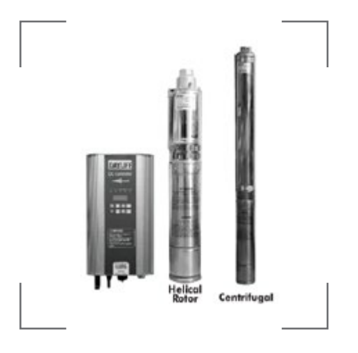
TERMS OF SALE Cash & carry