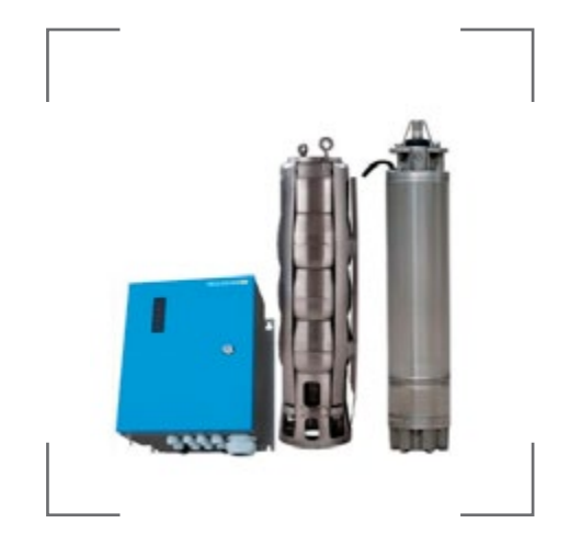
TERMS OF SALE Cash & carry