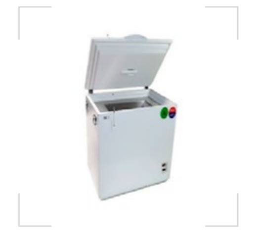
TERMS OF SALE Cash & carry