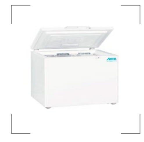
TERMS OF SALE Cash & carry