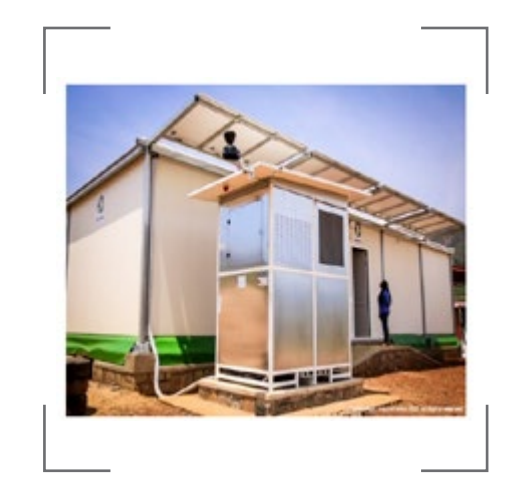
TERMS OF SALE Cash & carry, Flexible installments