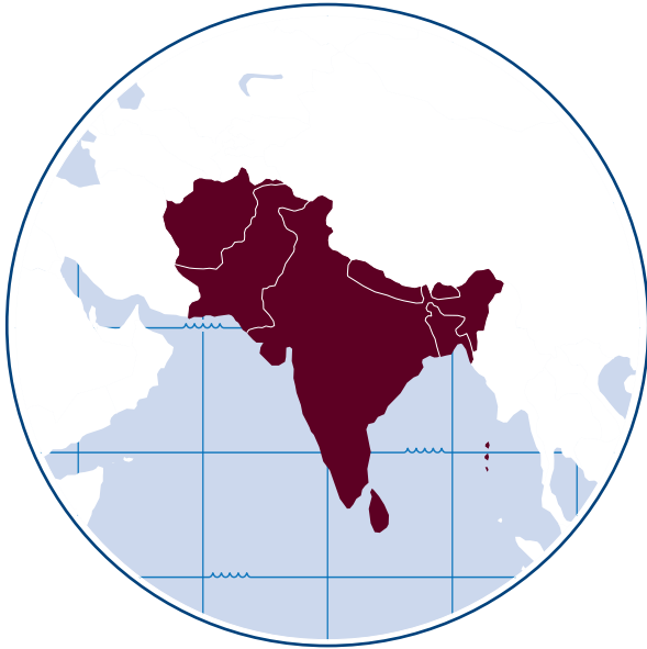
The South Asia region comprises Afghanistan, Bangladesh, Bhutan, India, the Maldives, Nepal, Pakistan, and Sri Lanka.

Chronic conflicts, drought, earthquakes, floods, seasonal storms, and severe winter weather, compounded by limited government response capacity in some countries, present significant challenges to vulnerable populations in South Asia. Between FY 2008 and FY 2017, USAID's Office of U.S. Foreign Disaster Assistance (USAID/OFDA) and USAID's Office of Food for Peace (USAID/FFP) provided humanitarian assistance in response to a diverse range of natural and man-made disasters in the region. Examples include cyclones in Bangladesh, India, and Pakistan; earthquakes in India, Nepal, and Pakistan; floods and landslides throughout the region; and complex emergencies in Afghanistan, Nepal, Pakistan, and Sri Lanka.