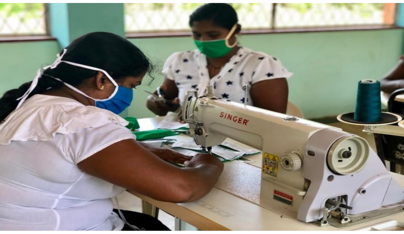
U.S. AGENCY FOR INTERNATIONAL DEVELOPMENT