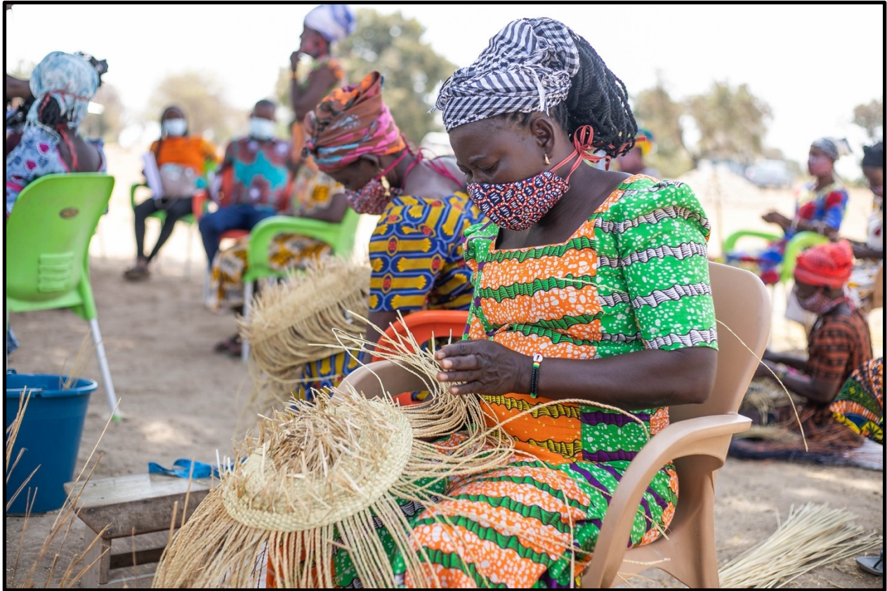
WATIH female beneficiaries weaving crafts for export.

October 4: The USAID Women’s Economic Empowerment Community of Practice (USAIDWEE CoP) hosted its quarterly learning event focused on women’s economic empowerment and trade on the theme “The Nexus of Trade and Gender Equality.”