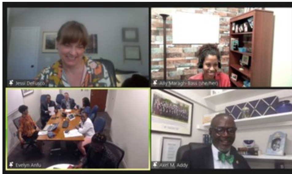
Screenshot of Panelists at the Roundtable.

September 28: The USAID/West Africa Regional Trade Team held a virtual roundtable event to discuss localization in trade and investment interventions in West Africa. The meeting aimed to explore strategies that will gradually position aid and support in a manner that will render trade systems more resilient to emerging shocks.