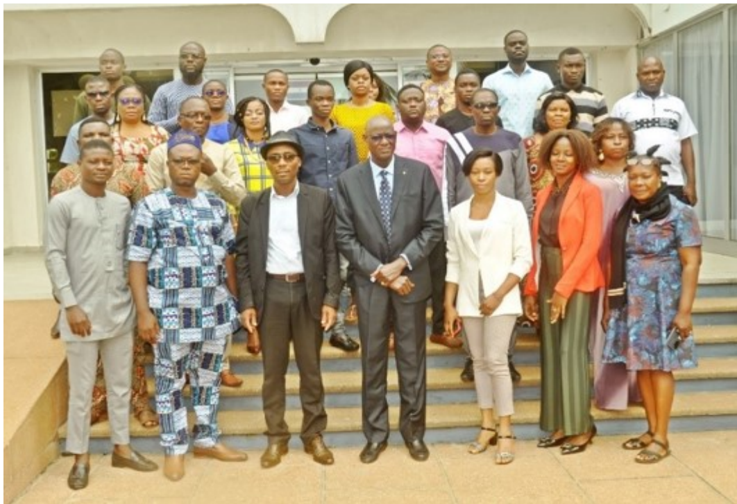
Participants at the workshop in Lomé.

Lomé, Togo, September 21: The United States Agency for International Development (USAID) and the Economic Community of West Africa Agricultural Policy (ECOWAP) organized a capacity building workshop in Togo on the African Growth and Opportunity Act (AGOA). Supported by the Chamber of Commerce and Industry of Togo (CCI-T), the workshop trained 42 participants, including 20 women, eager to explore the business opportunities and requirements of the US market.