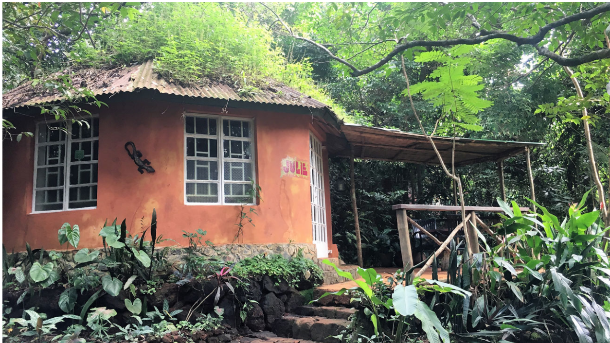
Ec lodge at the Tacugama Wildlife Sanctuary.

World Tourism Day, September 27: The West Africa Biodiversity and Low Emissions Development (WABiLED) program hosted a podcast to highlight ecotourism in West Africa on the theme for this year's World Tourism Day, 'Rethinking Tourism'.