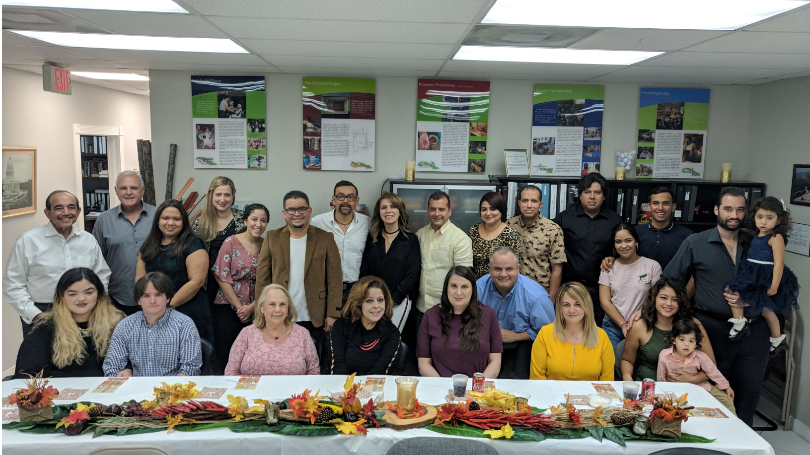
The ART Team gathered at the office, celebrating Thanksgiving and a year of accomplishments, year 2019.

Q: What types of humanitarian aid or development programs are utilizing the federal surplus property transferred by your organization?