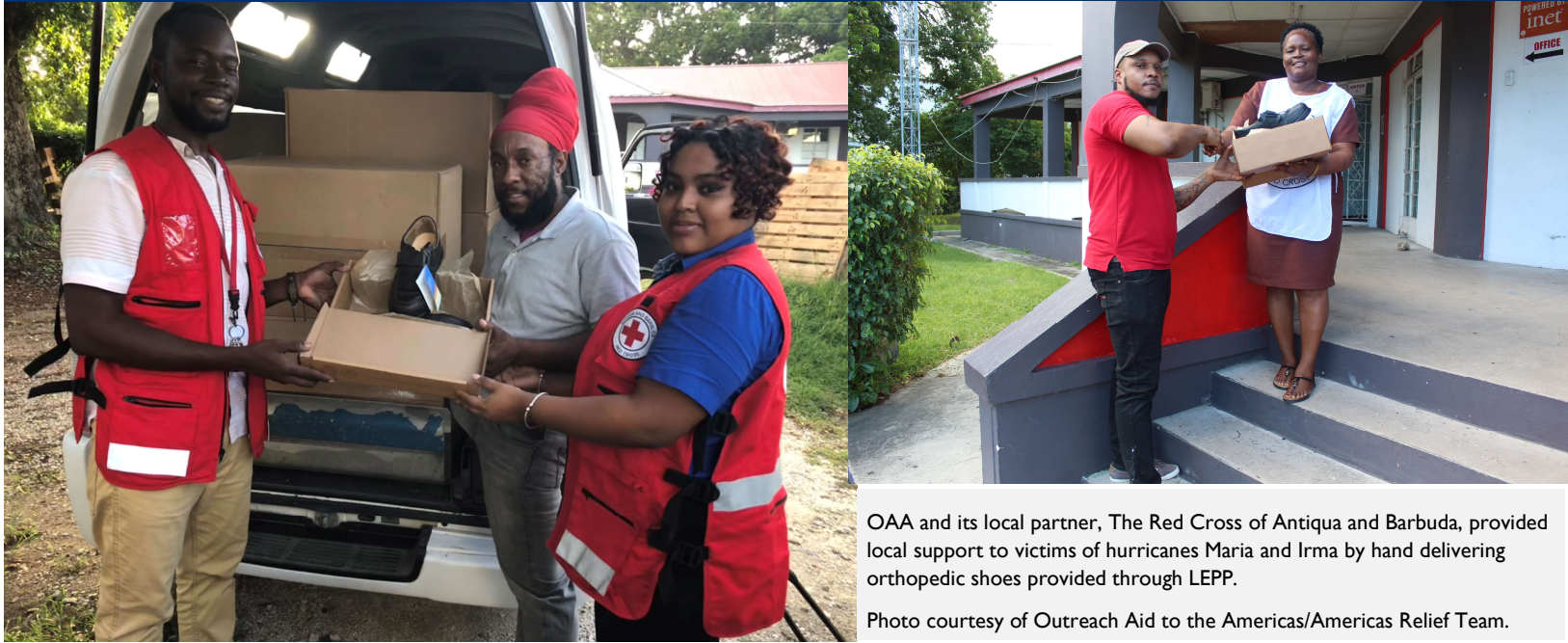
OAA and its local partner, The Red Cross of Antigua and Barbuda, provided local support to victims of hurricanes Maria and Irma by hand delivering orthopedic shoes provided through LEPP.