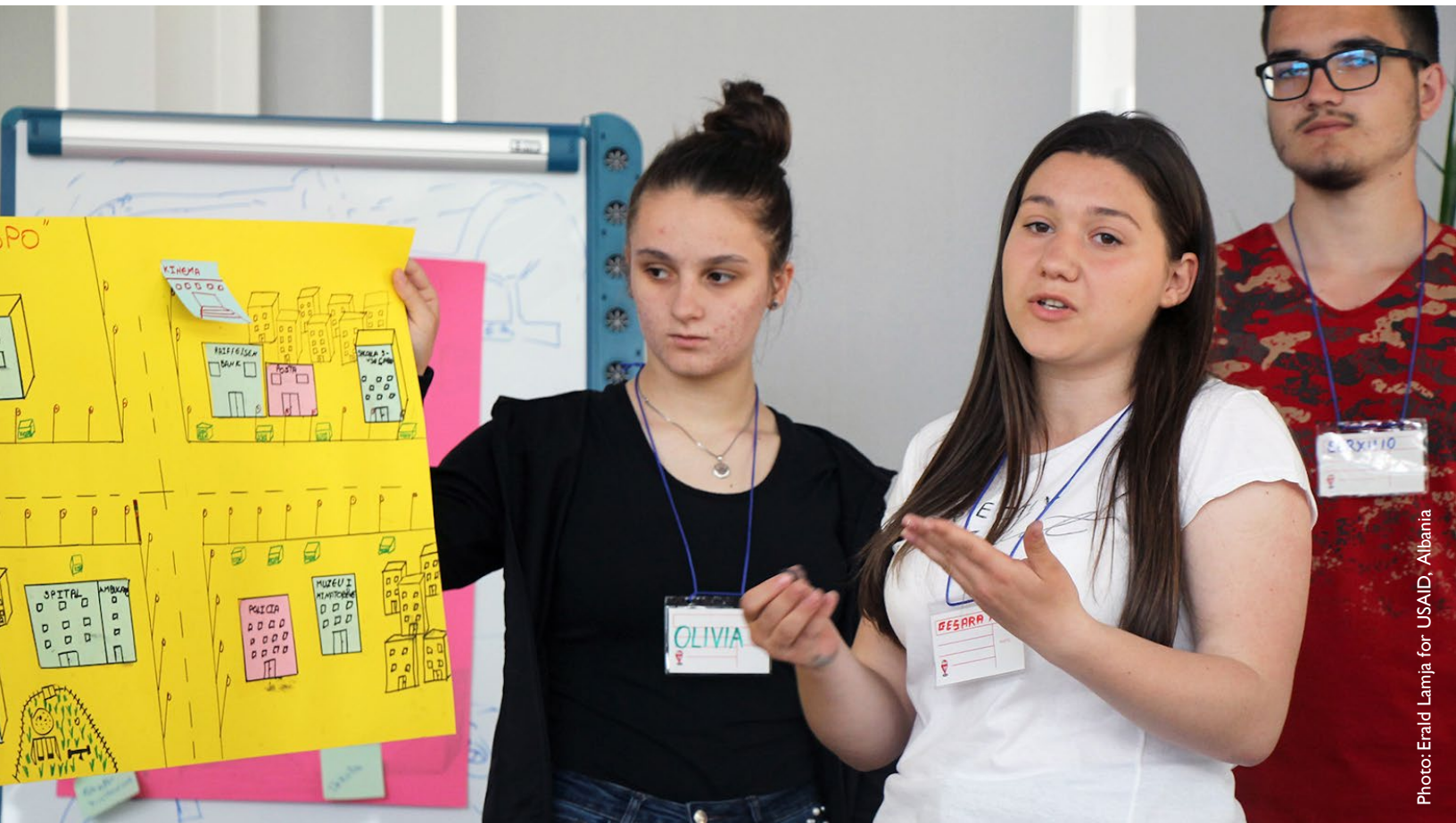
Albania

When services are not designed with youth in mind, youth may have low uptake because of barriers including existing cultural and social norms, insecurities, lack of age-specific information, limited mobility, time restrictions, financial considerations, low personal decision-making power, and security considerations. Young people from diverse backgrounds and circumstances will have differing needs and barriers. USAID must consider the diverse needs of youth populations to avoid unintentionally increasing disparities and reinforcing biases. Adolescent girls, young women, and youth from other marginalized groups or communities, in particular, experience barriers to accessing