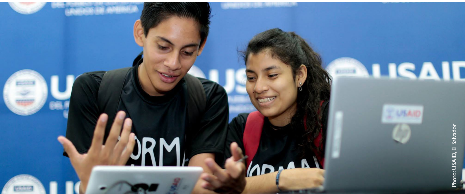
El Salvador