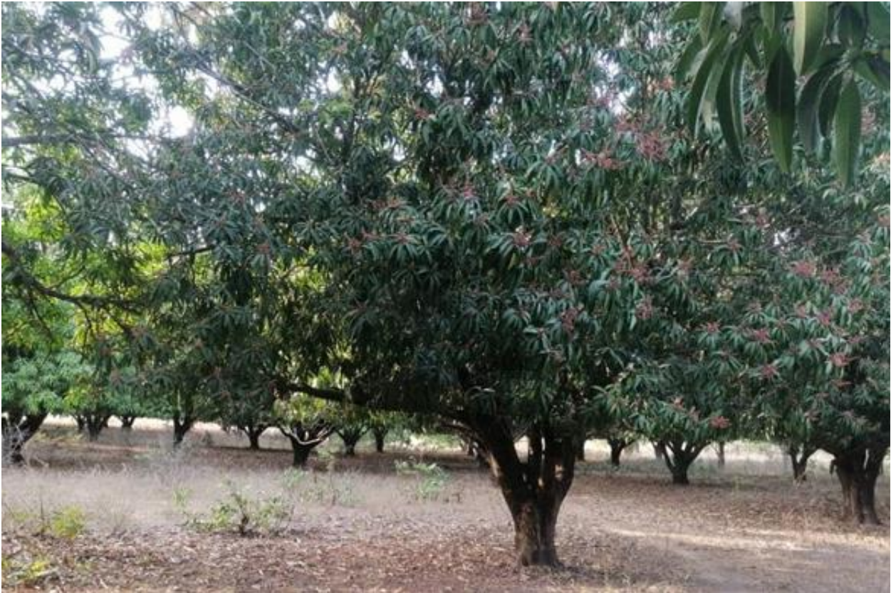
Traditional mango trees in a household in Benin.

The USAID-funded West Africa Trade and Investment Hub (WATIH) has partnered with Promo Fruits, a local fruit processing company in Benin, to accelerate the country's ability to harness the potential of the mango value chain to unlock new investment and provide thousands of smallholder farmers with a dependable source of income and improved quality of life.