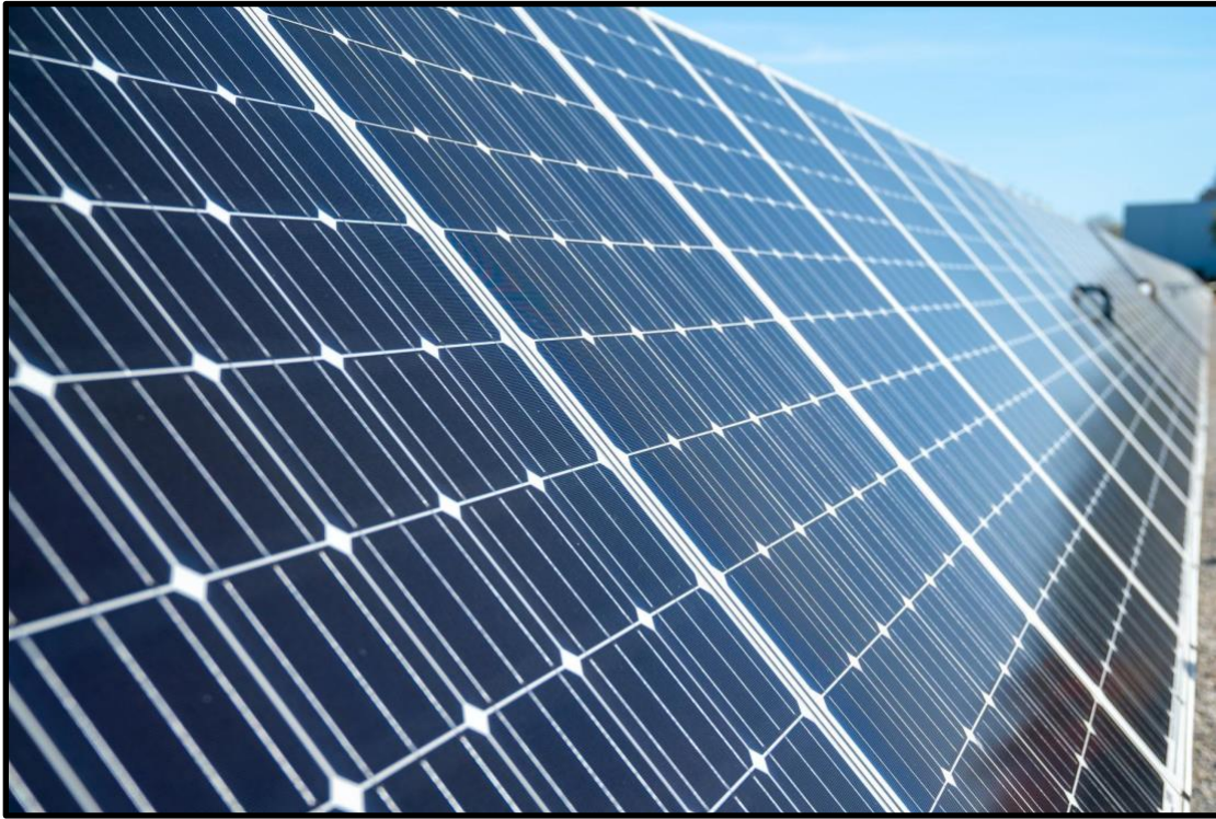
Solar panels, key to powering Senegal's clean power generation.

Power Africa is partnering with Senegal to develop and implement the country's Energy Transition Strategy to help mitigate the impact of climate change and increase energy access, reliability, and affordability. The strategy focuses on decarbonization through renewables and cleaner gas-to-power transitions. The document outlines how Senegal's current power generation can serve as a catalyst for renewables in the long term.