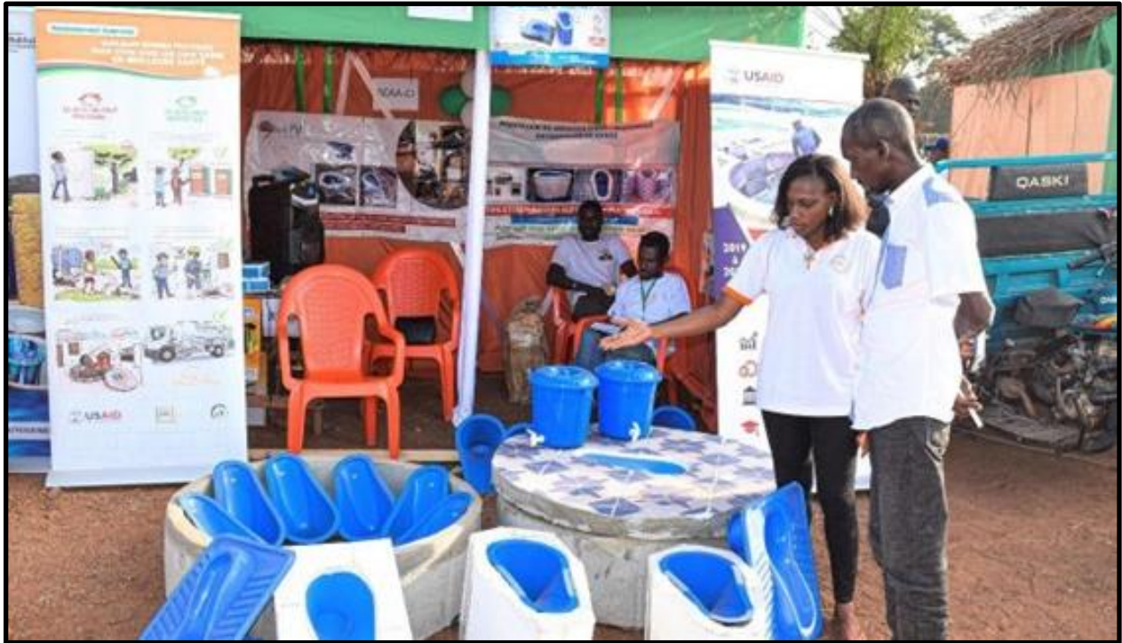
A MuniWASH-affiliated MSME showcasing sanitation products in Mankono, Côte d'Ivoire.

The USAID-funded Municipal Water, Sanitation and Hygiene Project in West Africa (MuniWASH) has been working to support the Sustainable Development Goal (SDG) 6, which targets universal and equitable access to safe drinking water, hygiene, and sanitation by 2030.