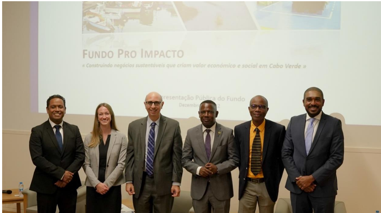
Representatives at the official launch of the Fundo Pro Impacto in Cabo Verde.

The USAID-funded West Africa Trade and Investment Hub has partnered with Injaro Investments Ltd., the World Bank, and Pro Capital (the venture capital vehicle of the government of Cabo Verde) to establish the Fundo Pro Impacto, a venture capital impact investment fund that invests in Small and Medium Enterprises (SMEs) in diverse sectors of the economy including technology, clean energy, aquaculture, and health.