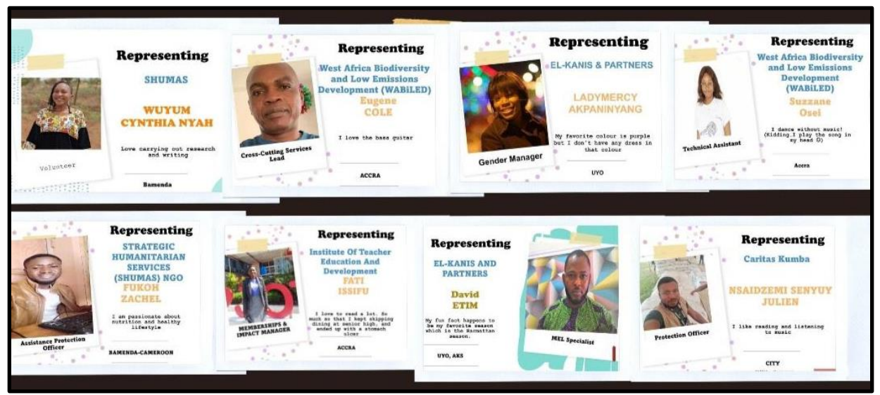
A collection of participant business cards from the workshops.

The Analytical Support Services and Evaluations for Sustainable Systems (ASSESS) Hosts Virtual Workshops on Monitoring, Evaluation, and Learning (MEL) and Communication