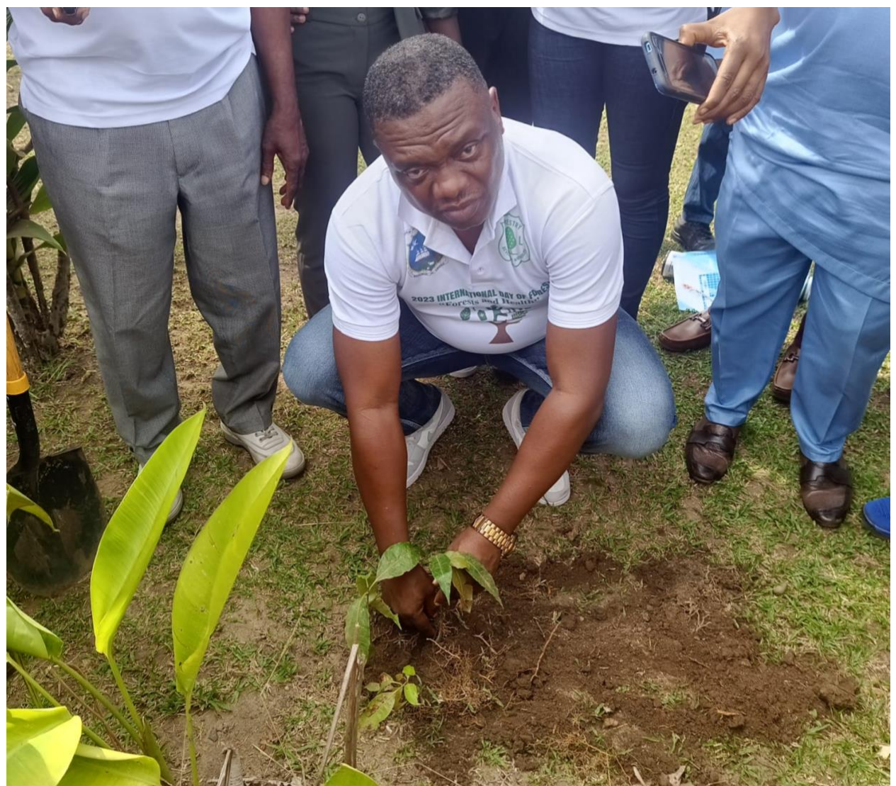
The Managing Director of Liberia's FDA planting a tree outside Buchanan City Hall in Liberia.

Liberia, March 21, 2023: With funding from the United States Agency for International Development (USAID), the West Africa Biodiversity and Low Emissions Development (WABiLED) and the Liberia Conservation Works Activity (CWA) embarked on a four-day awareness and outreach campaign to spread this year's International Day of Forests (IDF) message, "Forests and Health: a path to recovery and well-being."