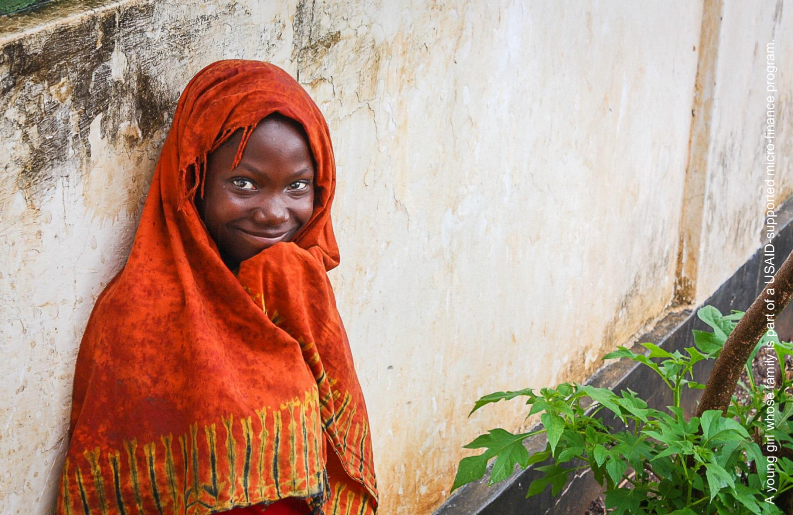
A young girl whose family is part of a USAID-supported micro-finance program.