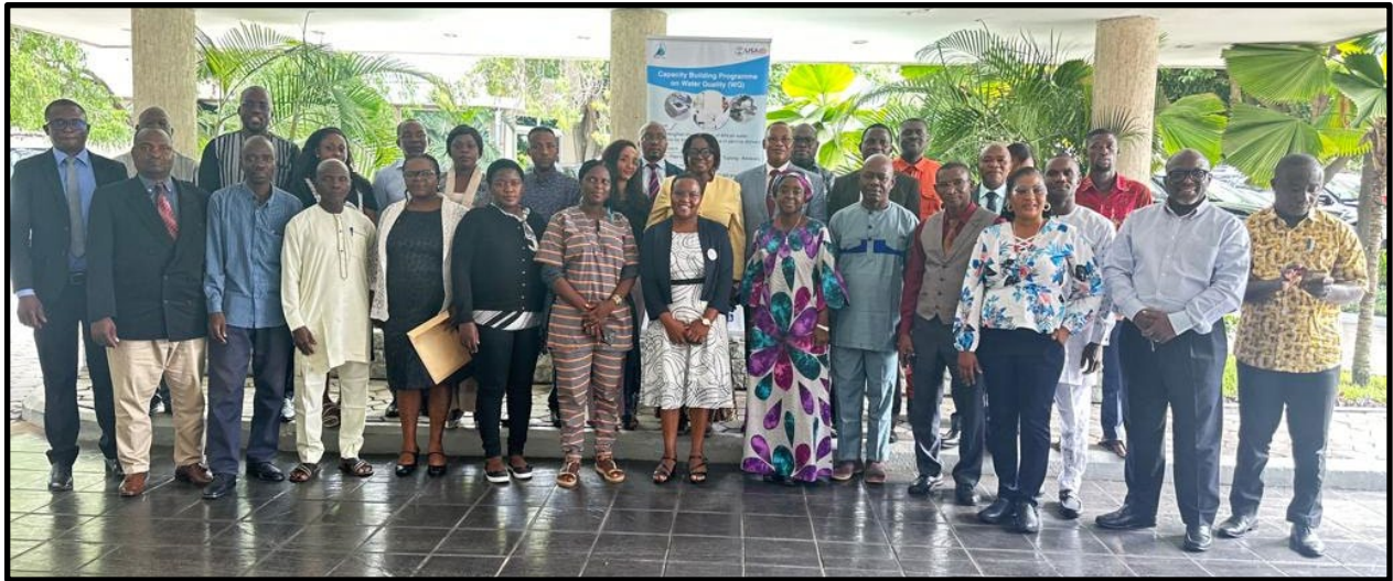
A group photograph of the participants at the workshop in Accra.

Accra, Ghana, June 7-9, 2023: The USAID-funded African Water and Sanitation Association (AfWASA) has organized a workshop on the development of laboratory quality assurance manual as part of its capacity building mandate, in partnership with the Ghana Water Company Limited (GWCL) and the water and sanitation company of Burkina Faso (Office National de l'Eau et de l'Assainissement [ONEA]). The workshop's focus was on developing a comprehensive laboratory quality assurance manual, aiming to strengthen the capacity of participating companies in managing water quality analysis and control laboratories.