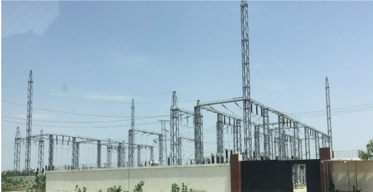
An electricity substation in West Africa.

The West African Power Pool (WAPP) has achieved a significant milestone in the journey towards regional electricity integration in West Africa. By permanently synchronizing the power grids of twelve West African countries, including Benin, Burkina Faso, Côte d'Ivoire, Gambia, Ghana, Guinea, Liberia, Mali, Mauritania, Senegal, Sierra Leone, and Togo, WAPP is forging a unified regional electricity market. This major accomplishment, realized under the supervision of the WAPP Information and Coordination Centre (ICC) and the national control centers of the respective countries, marks a crucial step in interconnecting the power transmission networks of the Economic Community of West African States (ECOWAS) members.