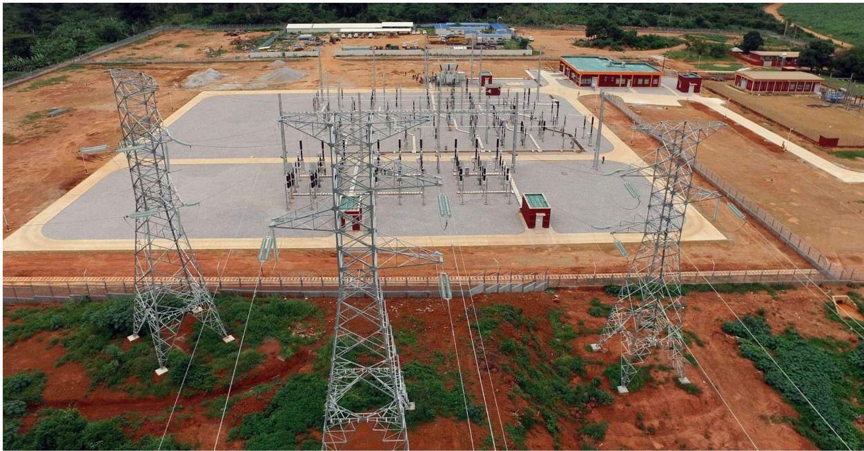
A distribution line in Côte d'Ivoire.

Power Africa has held a series of training sessions on improving field data collection through the use of tablet-based technologies and open-source software to address challenges in the use of geospatial information systems (GIS). Through these trainings and the use of the new data collection systems, Côte d'Ivoire's national utility company, CI-ENERGIES, has made advancements in achieving its Electricity for All Program ( in French, Programme Électricité Pour Tous [PEPT] ) goals.