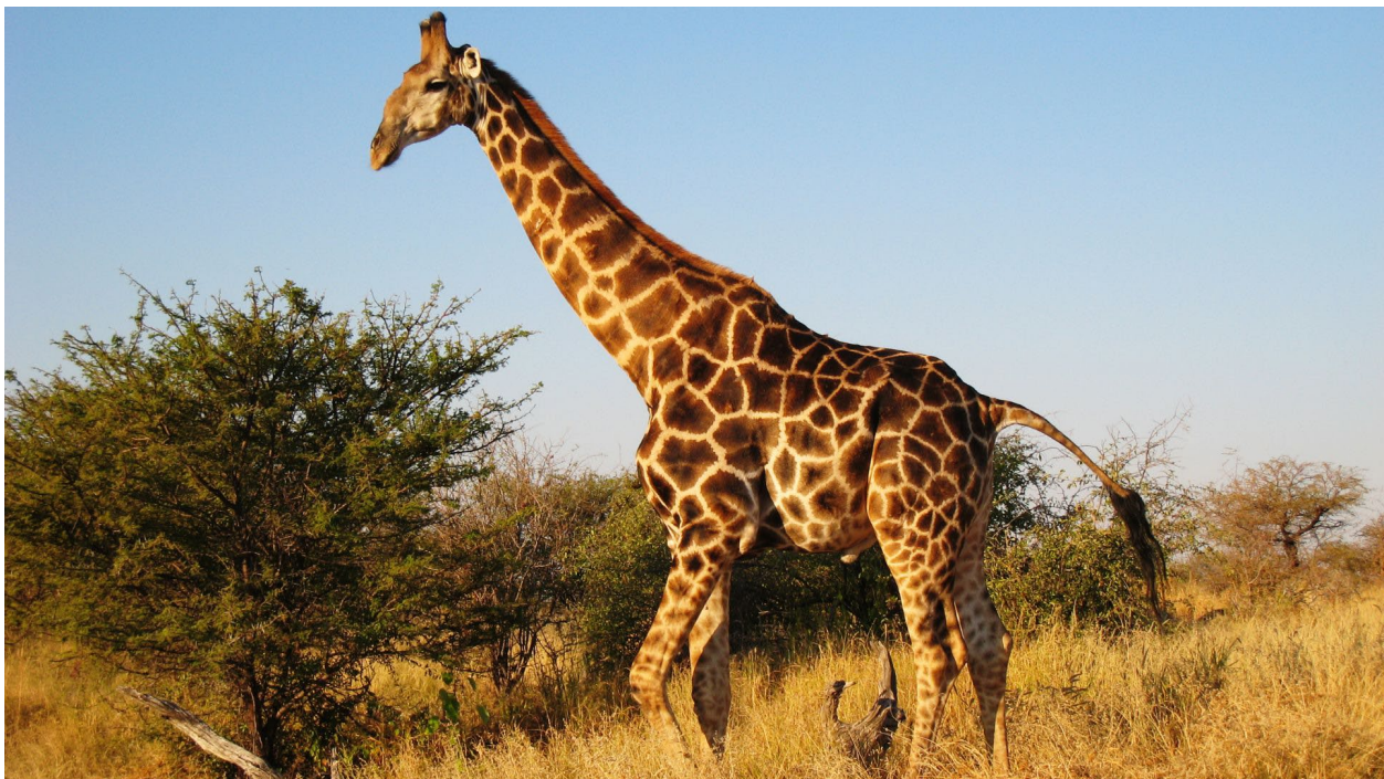
A giraffe walking through the savannah grass in Africa.

The USAID-funded West Africa Biodiversity and Low Emissions Development ( WABiLED ) program continues to build on the successes of its predecessor, the West Africa Biodiversity and Climate Change ( WA BiCC ) program, in combating wildlife crime. Through these efforts, Niger has passed its national strategy to combat wildlife crime, the second country in the region to validate and complete its national combating wildlife crime strategy.