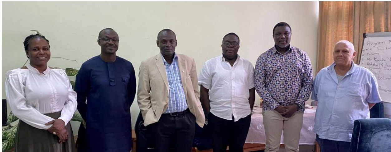
Some participants after an FMA debrief session in Accra.

Ten selected private sector associations (PSAs) in Ghana have reviewed their financial management assessment (FMA) results, and demonstrated their readiness to develop their operational and financial management capacities with support from the USAID-funded Connect and Learn for Sustainable Associations ( CLOSA ) project. These PSAs span a wide breadth of sectors and include; the Ghana Registered Nurses and Midwives Association, the Federation of Associations of Ghanaian Exporters, the Ghana Chamber of Commerce and Industry, the Private Enterprise Federation, and the National Association of Beauticians and Hairdressers.