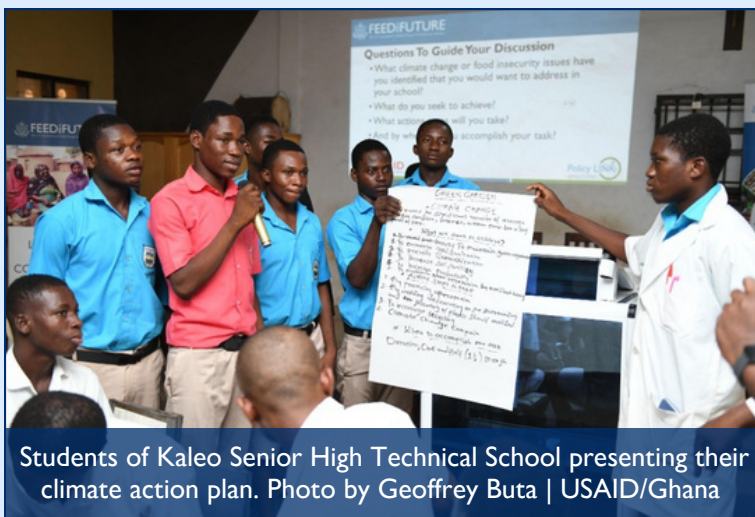
Students of Kaleo Senior High Technical School presenting their climate action plan.