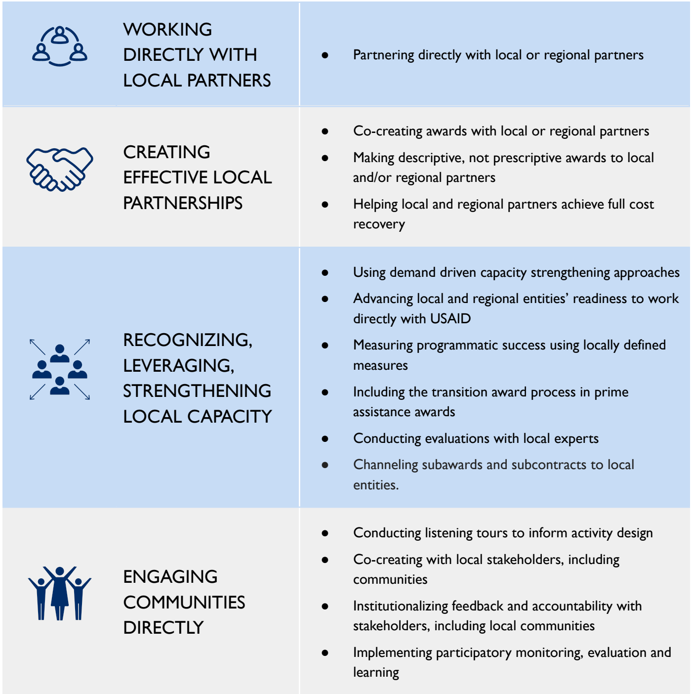
Figure 2: The 14 good practices measured during USAID’s pilot of the Locally Led Programs indicator