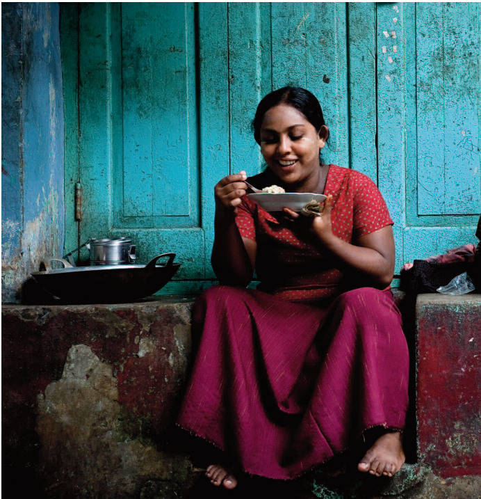
A woman eats rice on a street in Rangoon.