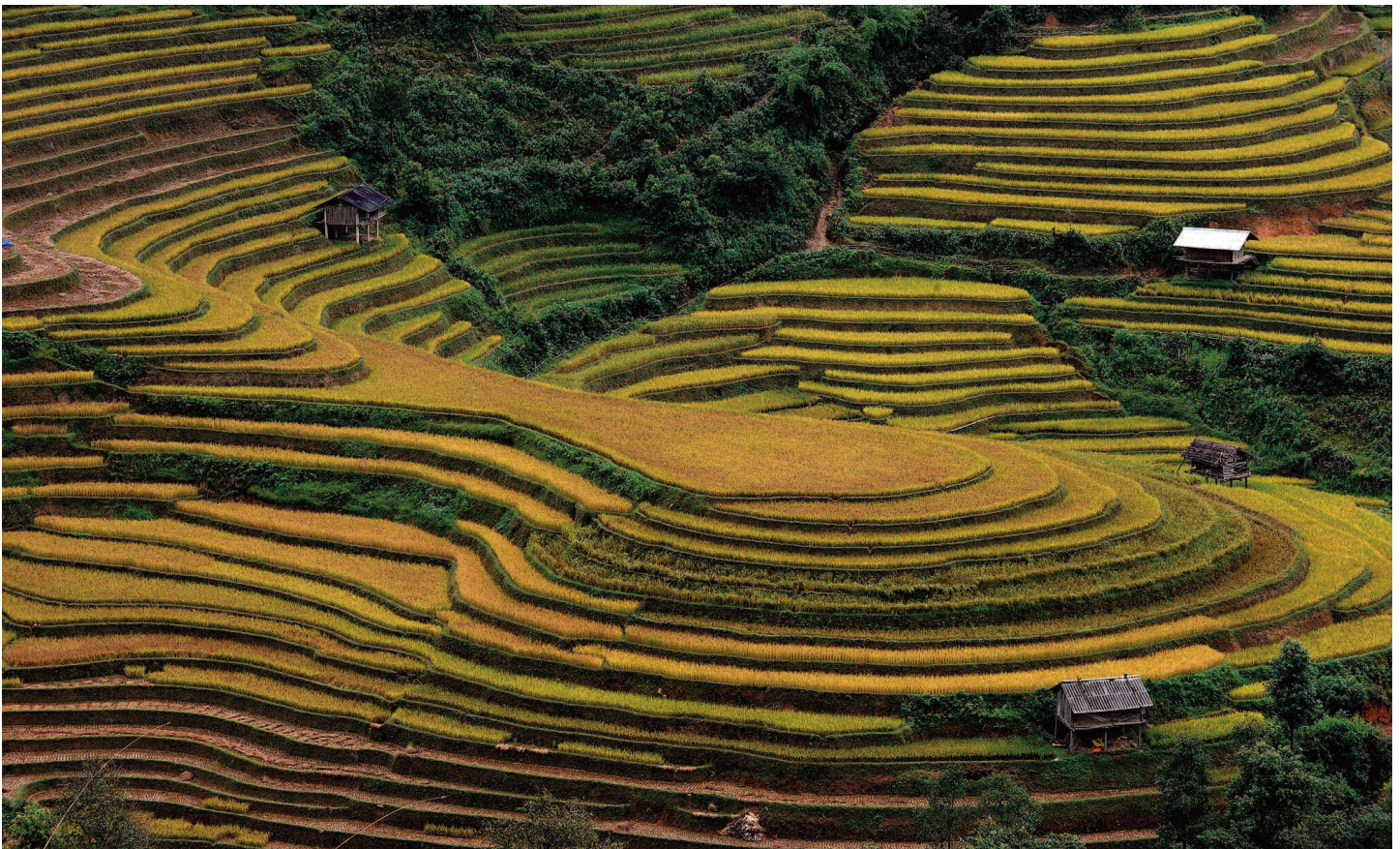
This picture taken on October 2, 2013 shows terrace rice fields in Mu Cang Chai district, in the northern mountainous province of Yen Bai.

Taken together, expanding the results we seek and deepening the way we consider risks will better ensure that we are investing and engaging with sustainability clearly in mind. Going forward, USAID will rely more on the approach of providing incentives in support of sustainability than on specifying targets for partnering with particular types of local actors or utilizing particular types of assistance. 10 A more holistic set of incentives, as laid out here, will help ensure that all of our potential investments are assessed in the same way for the results they generate, the risks they face and the rewards they offer. This even-handed examination of results, risks and rewards will empower staff to make the best choices about where to work and what partners to work with to support sustained development.