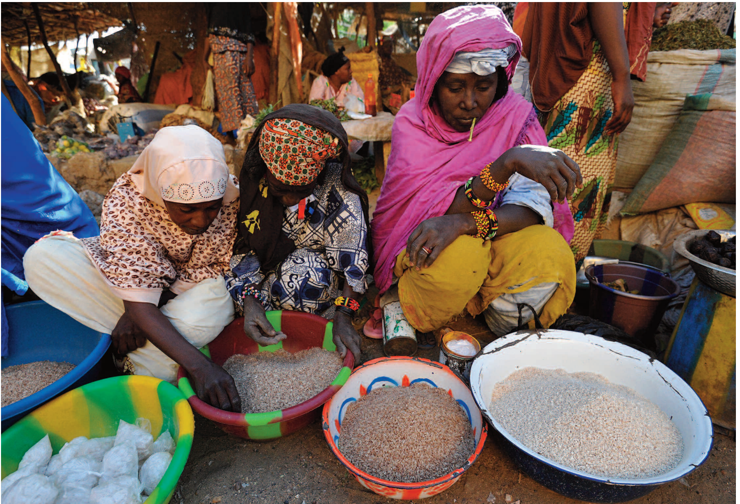
Women sell rice on January 30, 2013 at a market in the northern city of Gao.