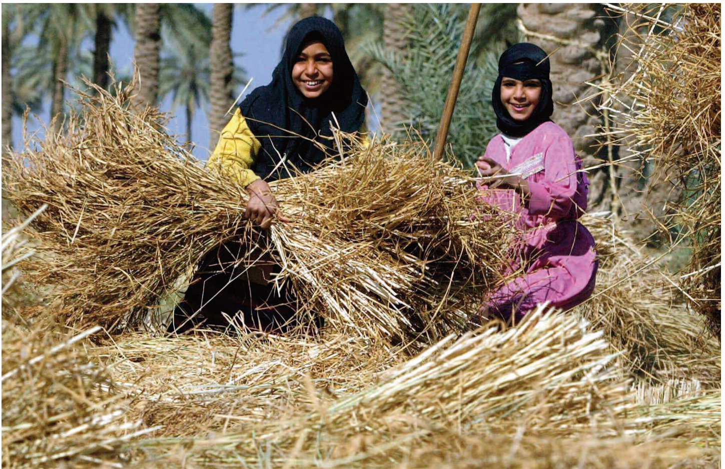
Iraqi girls harvest high-quality amber rice in the Abbasiyat area, near the Shiite Muslim holy city of Najaf, about 160 kms south of Baghdad, November 11, 2002.

local system to produce desired outcomes. And in this context, where sustainability is the ultimate objective, USAID is committed to employing all of our development resources to strengthen and use local systems.