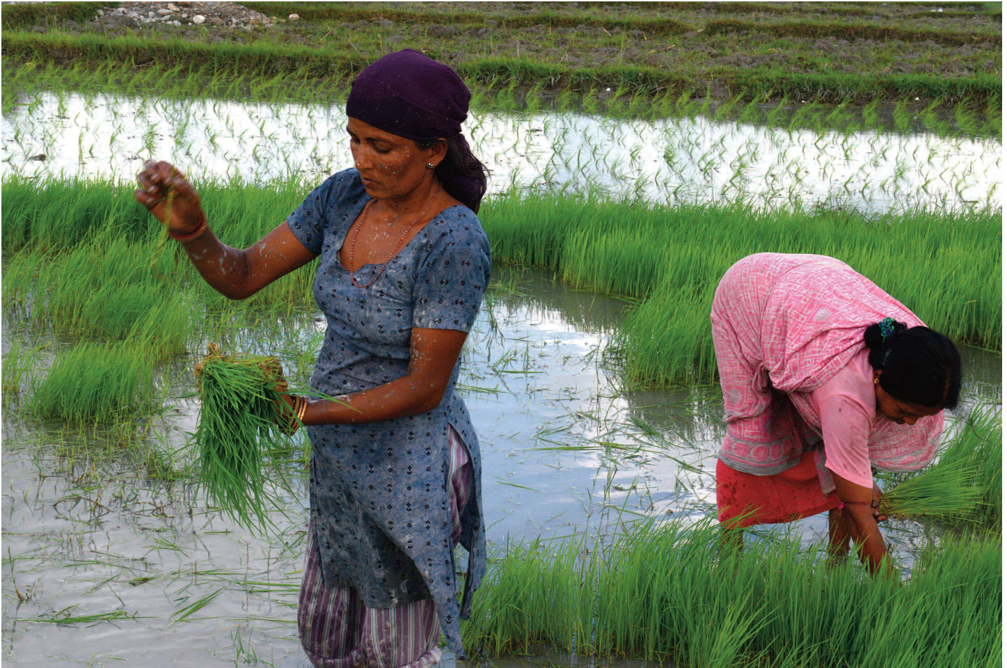
Indian farmers plant paddy saplings in a field at Milanmore village, on the outskirts of Siliguri.

Taking these initial steps, and indeed progressing toward the broader vision, will certainly require leadership, insight, creativity, resourcefulness and courage from many, both inside USAID and in the wider development community. But even more, such change will require persistence. Realizing these changes will take years and will be challenging to sustain in the face of demand for immediate results and the attraction of the tried-and-true. Yet we must remain steadfast. Supporting sustained development is what defines us and is what the world expects.